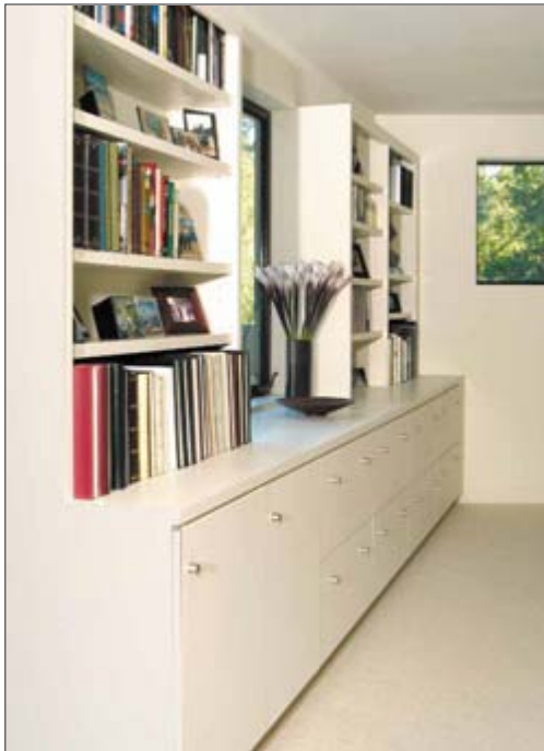
For the landing above the staircase, Nyquist designed a spacious bookshelf/storage cabinet.

out on the bayou and allow the subtle play of light throughout the day. Because the windows face south, they are low-E, insulated, tinted glass. The house also has an overhang that has been angled to shield the inside from the harsh summer heat while allowing the winter light and warmth to shine through. A patio in back along the bayou is ideal for barbecuing and connects to a small lawn and a garden which is still in the planning stage.