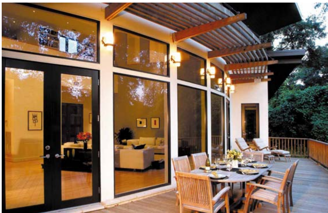
In good weather, the backyard deck is a favorite dining spot. Two overhangs shield the south-facing windows from harsh summer sun while allowing winter light to shine through.