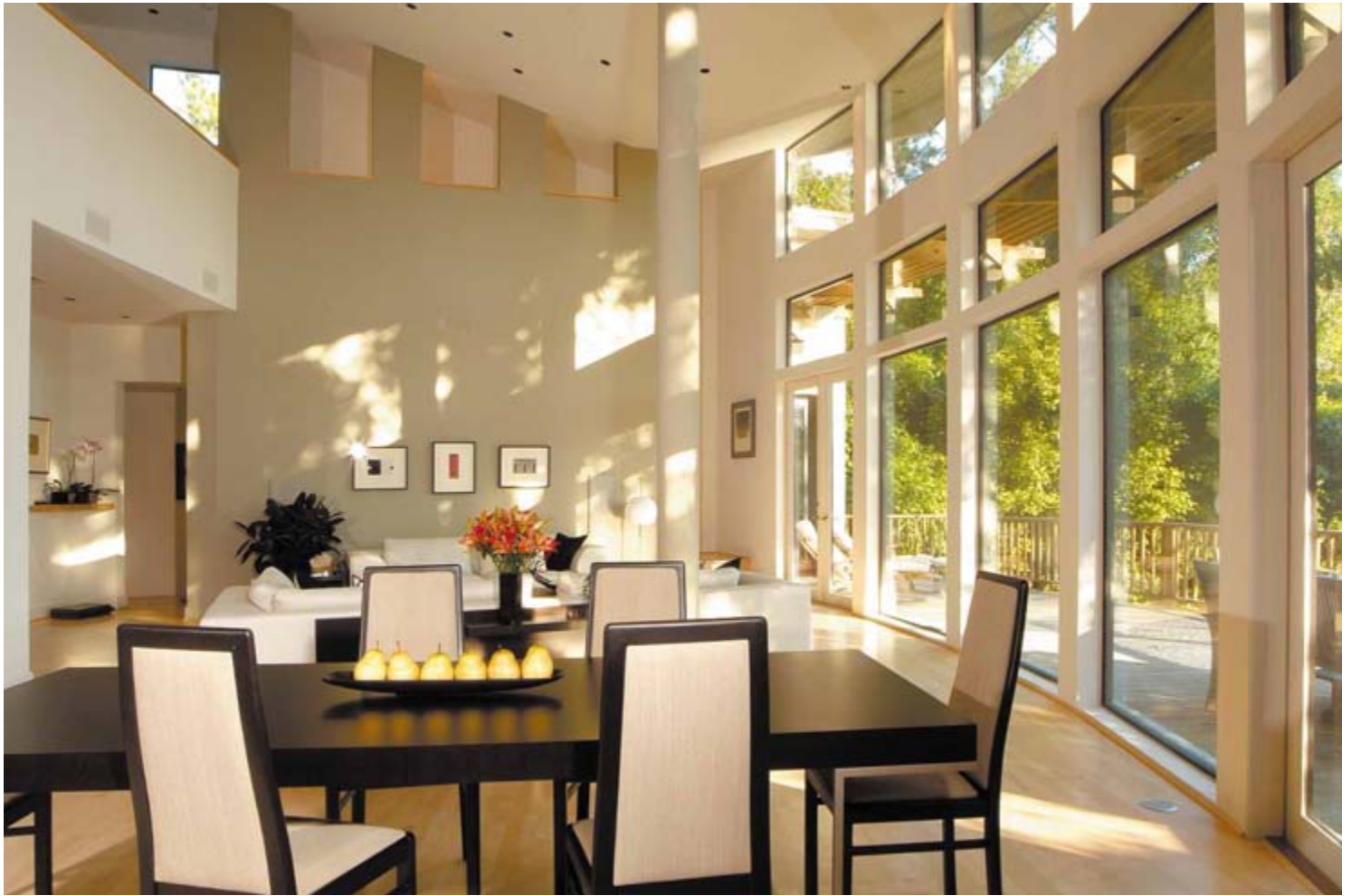
Every afternoon, the living room wall catches the play of sunlight and shadows from bayou trees. The wall color is Sherwin Williams' City Line. Lithographs over the sofa are by Ana Vilarrubias, an artist from northern Spain.