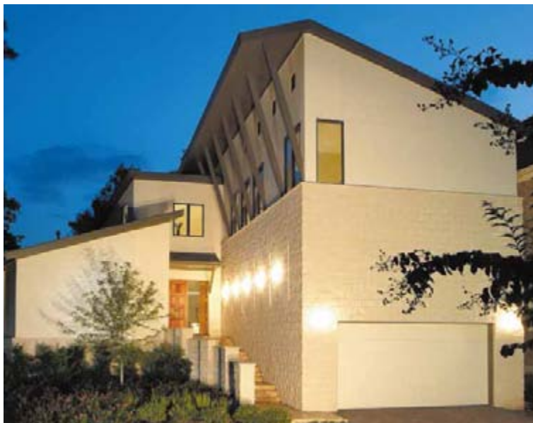
Architect Brent Nyquist's plan raised the house 7 feet above the curb to protect it from bayou flooding. The raised house rises gracefully above the flood plain without looking like a beach house on stilts.