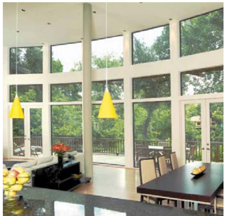
The view from the kitchen.

Art Consultant 713-529-0363 Assisted homeowners in acquiring lithographs on living room wall